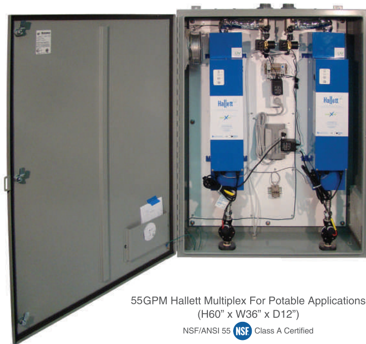
55GPM Hallett Multiplex For Potable Applications (H60" x W36" x D12") NSF/ANSI 55 NSF Class A Certified

Simple “in and out connections”, the benefits of the NEMA® cabinet enclosures with forced air ventilation and the minimal labor cost to install and commission make the Hallett Multiplex as effective as it is economical.