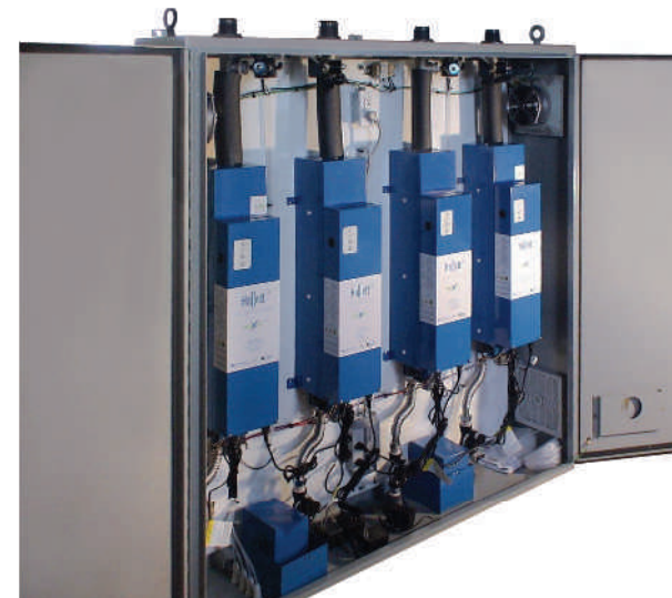
110 GPM Hallett Multiplex For Wastewater Applications (H60" x W60" x D12")