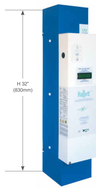
Hallett 30 4-20mA Data Output