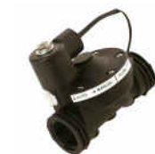
Automatic Shut-off Solenoid Valve (Optional on all models)