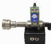
External Purge Valve (Optional on all models)