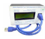
Hallett Diagnostic Tool (Optional on all models)