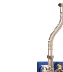
Flexible stainless steel hook-up hoses (Standard on all models)